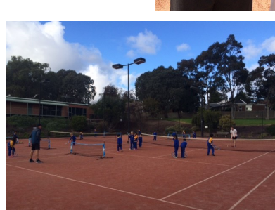
Serpell Primary School Kids in the Hot Shots Program